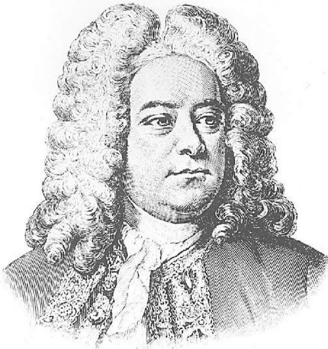
George Friderick Handel